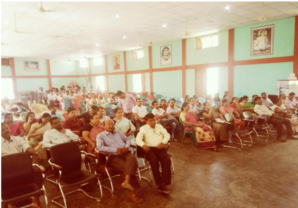
Teachers, Research Scholars & other Delegates gathered in the Seminar