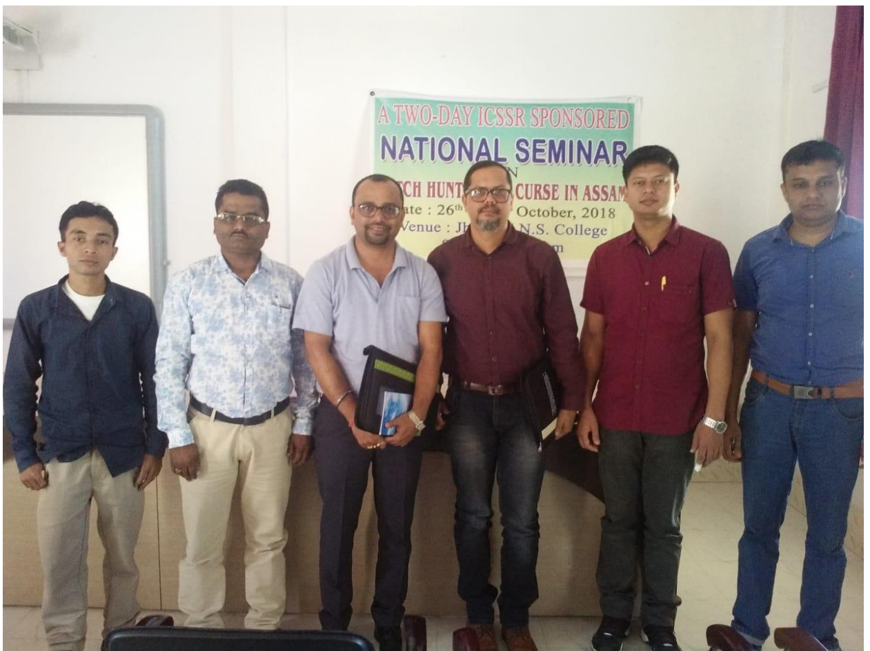
Some of the Participants of the Seminar