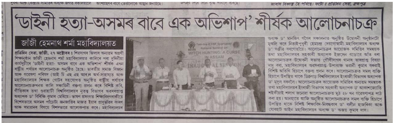
News Report Published in an Assamese daily News Paper on 26/10/2018