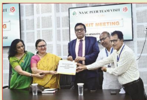
NAAC 3rd Cycle Assessment, Peer Team Visit on 12/05/2023 & 13/05/2023