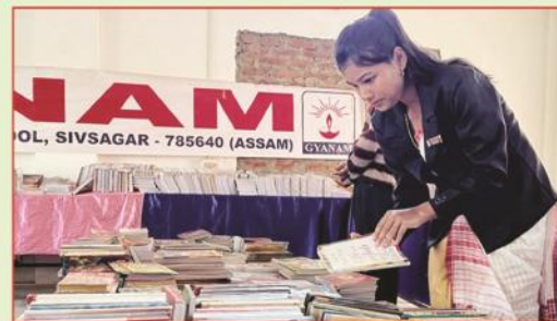
Golden Jubilee Celebration of Assamese Department on 24/12/2022