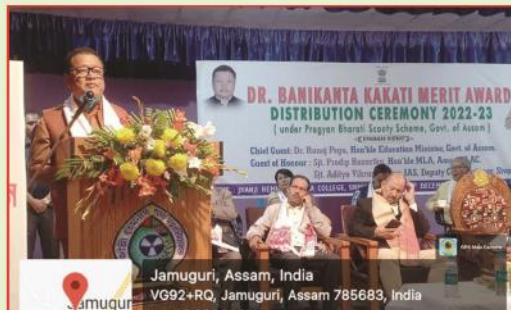
Dr. Banikanta Kakati Merit Award Distribution Ceremony on 09/12/2022