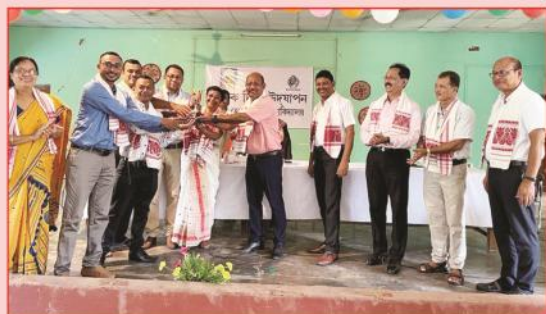
Teachers' Day Celebration