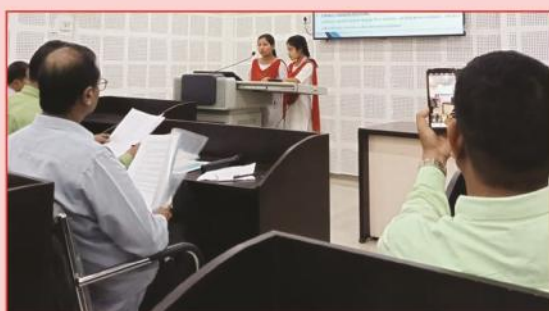
State Level Student Seminar