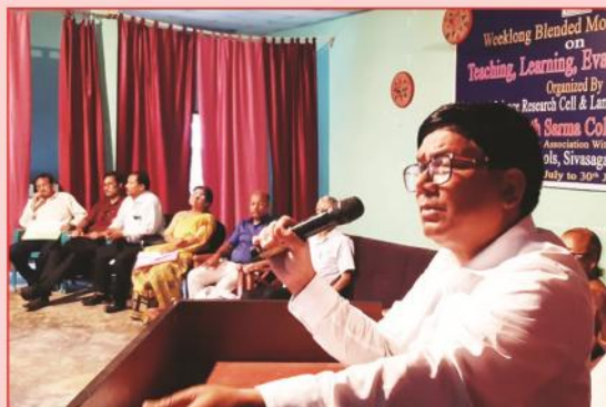
Workshop (Blended Mode)