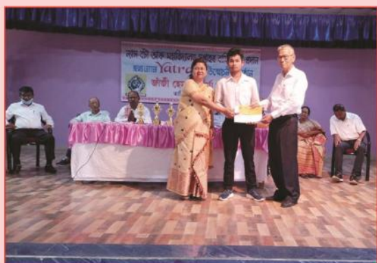
Memorial Trust Award