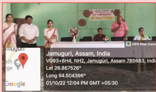
Pre Celebration of Gandhi Jayanti