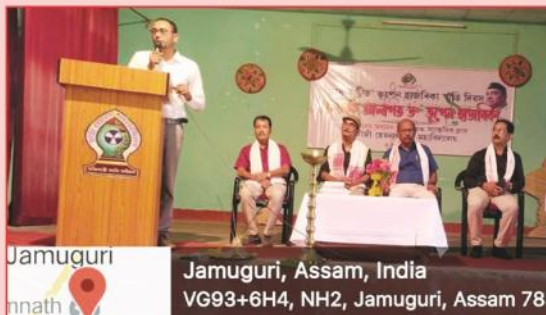
Sudhakantha Dr. Bhupen Hazarika Smriti Divas