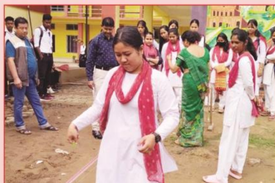
Inauguration of Handloom Weaving