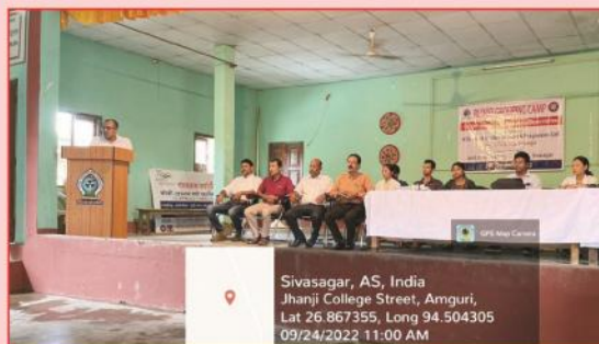
Blood grouping Camp