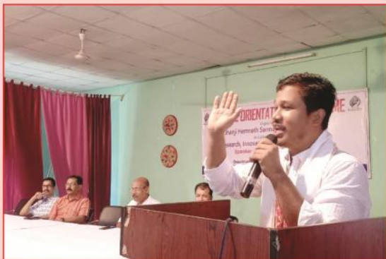
Special Orientation Programme for newly enrolled H.S and B. A Students