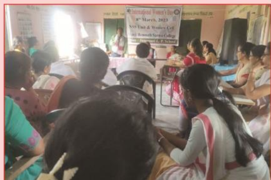
International Women's Day & Health Awareness Programme