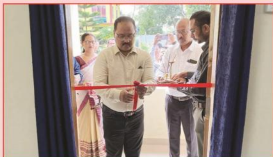
Inauguration of Sankardev Study Centre Building