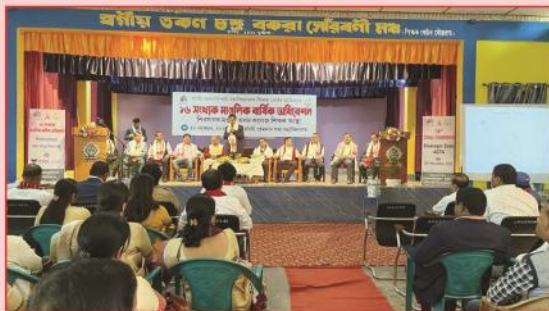
16th Zonal Conference, Sivasagar Zone, ACTA