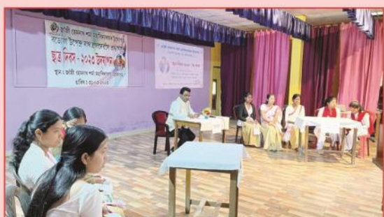
Student Day Celebration (Birth Anniversary of Bodofa Upendra Nath Brahma)