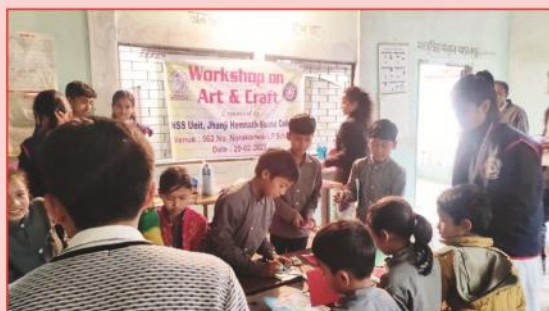
Workshop on Art & Craft