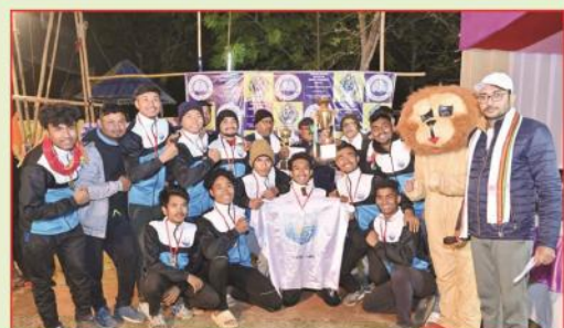
Inter College Kabaddi Tournament (Under Dibrugarh University) on 03/01/2023 to 04/01/2023