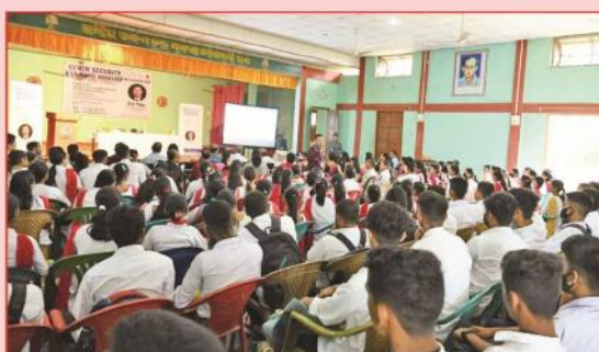
Cyber Security Awareness workshop