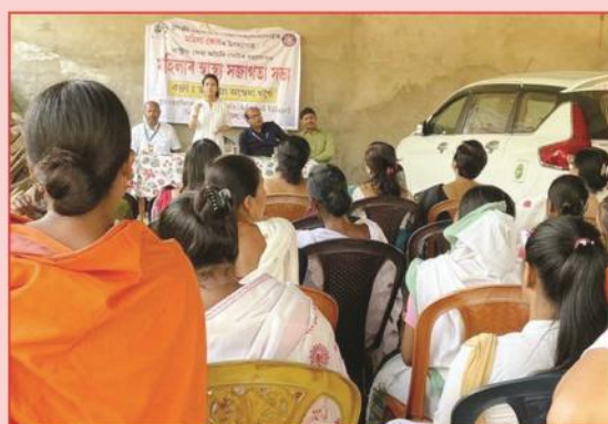
Health Awareness Programme